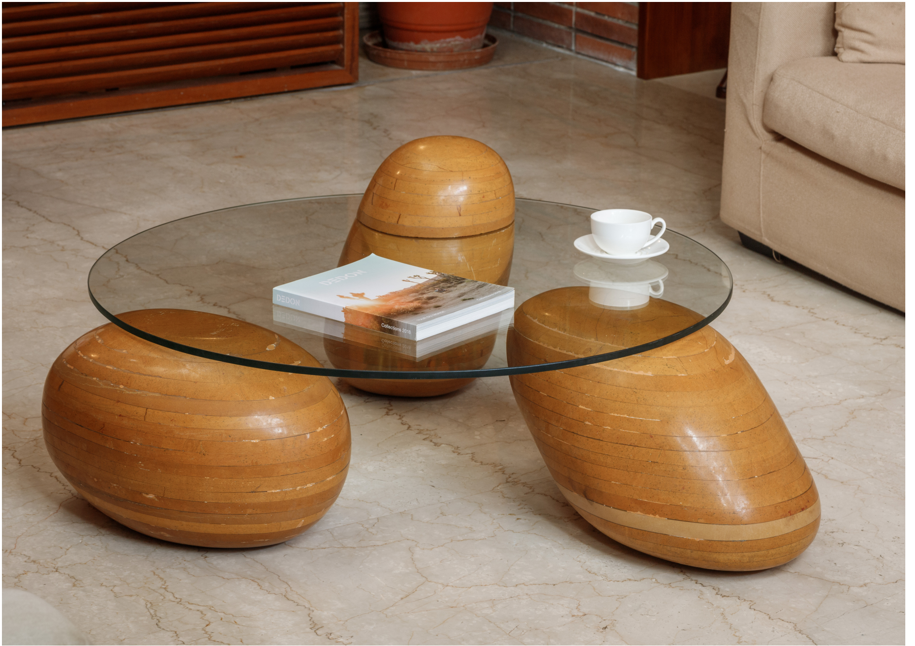
D01 Echoes of Ancient Feasts