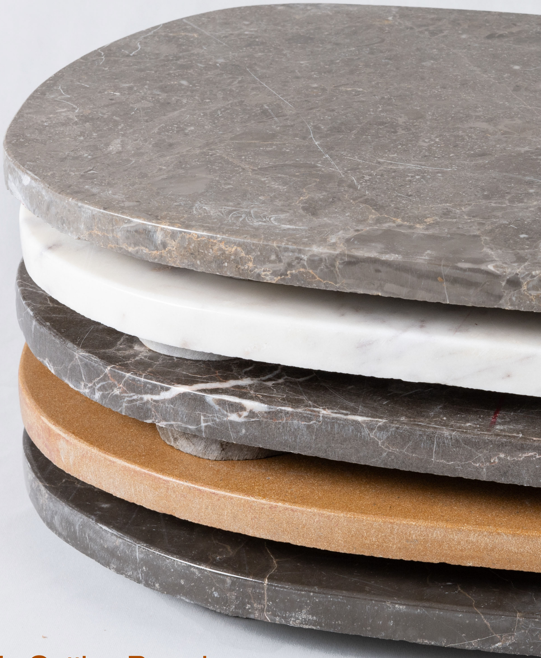
C01 Marble Cutting Boards Echoes of Culinary Artistry