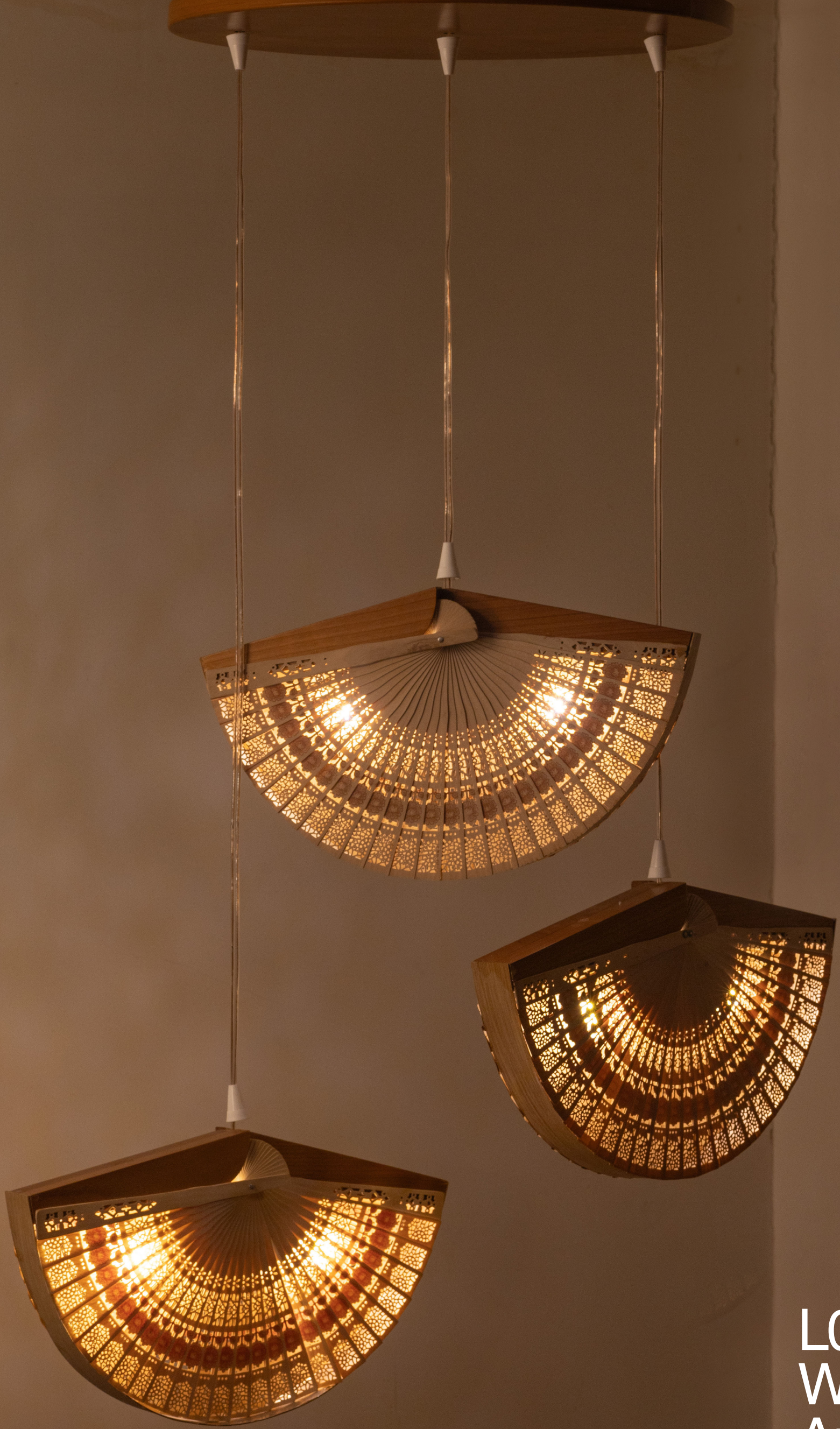
L01 Wind And Fire